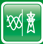
POP Power frequency overvoltage protection (Electrical supply)