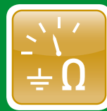
Monitoring of grounding systems