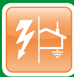
External lightning protection systems