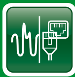
Surge protection for telecom and signalling networks